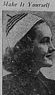
SKULL CAP—Whip this up with your crochet hook, perch it atop your curls and watch your friend's beam. Made of mercerized croch. cotton, it can be used in any audacious combinations of your best colors. Designs like this will be exceedingly popular this fall among fashion accessories. Junior crocheters, in particular, will love it. Directions for crocheting it may be obtained by sending a stamped, self-addressed envelope to the National Crochet Bureau, 522 Fifth Avenue, New York City. Sew-by-stitch card no. 18.