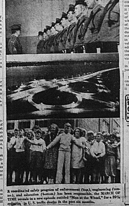
A coordinated safety program of enforcement (top), engineering (center), and education (bottom) has been responsible, the MARCH OF DIMES reveals in a new episode entitled "Man at the Wheel," for a 20% reduction in U. S. traffic deaths in the past six months.