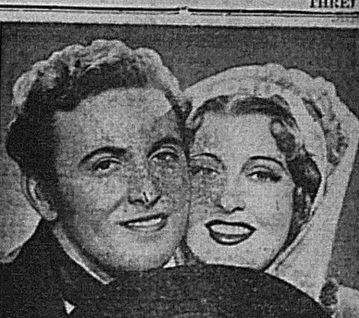
SAVING TO SPEND

...young. If, after the age of twenty, they are carrying financial responsibilities too heavy for their strength, I hope to be able to give them the same help—in college or in marriage—that I would give any human being in the same circumstances. And on the same basis, I consider it an insult to an adult human being to offer to "subsidize" him. And if my boys are not adult human beings when they are twenty years old, then I have shortened their lives as much as if I had cut them short with a bullet."