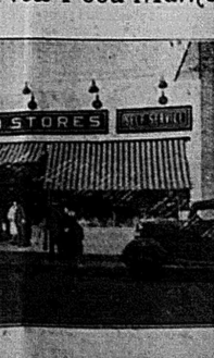
ABOVE—Interior view of the new self-service A. & P. Super Food market opened yesterday at 71-72 Broadway, Hicksville, showing the wide aisles and time saving arrangement of departments. LEFT—Exterior of the new market in the Spiro building in the heart of the business district.