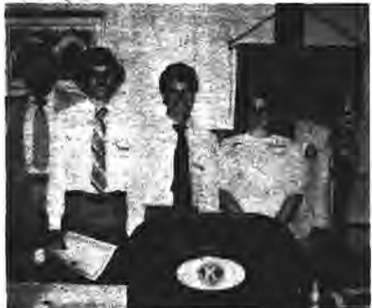
On July 9th, the Kiwanis Club of Hicksville made the presentation of four Scholarships to Hicksville students. In the picture are, from left to right: